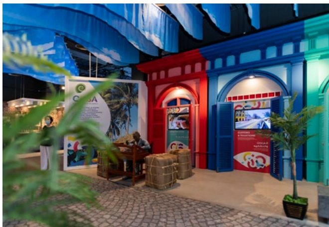
Cuba’s area at the Dubai Expo 2020.

In most cases, host countries pay Cuba directly with public funds. However, Cuba also enters into tripartite “collaboration” or triangulation agreements by which third party governments and international organizations—including WHO, the United Nations International Children’s Emergency Fund (UNICEF), and the Pan American Health Organization (PAHO)—pay for Cuba’s health services to underdeveloped countries. 137 By example, Cuba has received financial assistance for its medical missions in