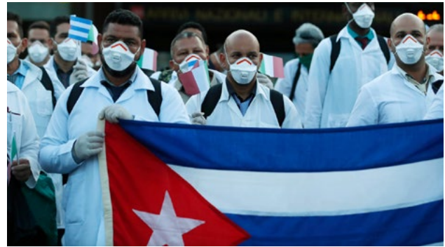
Medics and paramedics from Cuba pose upon arrival at the Malpensa airport of Milan, Italy, Sunday, March 22, 2020. Fifty-three doctors and paramedics from Cuba arrived in Milan to help with coronavirus treatment.

The pandemic has also allowed Cuba to revitalize its medical missions program and propa-