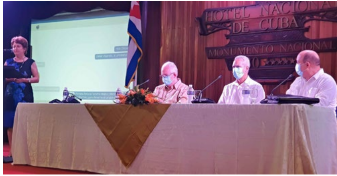
Announcement of the First International Fair of Medical and Wellness Tourism.

Honduras, Haiti, Niger, Rwanda, and Mali from the governments of Germany, France, Japan, Norway, and Australia. 138 During the 2014 Ebola epidemic, WHO financed Cuba’s medical missions to Liberia and Sierra Leone. 139 From 2013 to 2018, PAHO charged a 5% fee to serve as an intermediary for Brazil’s Mais Medicos program, an agreement that earned Cuba $400 million per year. 140