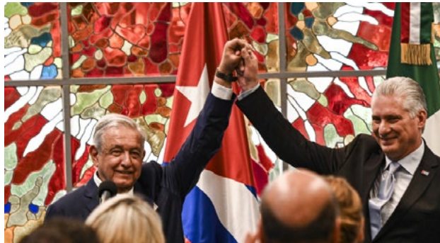
Cuban President Miguel Diaz Canel, right, and his Mexican counterpart Andres Manuel Lopez Obrador, left, raise their arms during a ceremony to award the Jose Marti order to President Lopez Obrador, at Revolution Palace in Havana, Cuba, Sunday, May 8, 2022.

This combination of international support and financial exploitation has prevented the Cuban government from facing widespread condemnation from the international community and adopting structural reforms to end human trafficking. As a result, stopping human trafficking in Cuba's medical missions will require a complex response that addresses all contributing factors that permit the exploitation of medical workers.