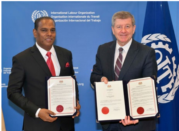
Cuban official giving declarations related to the Forced Labour Convention.

The International Labour Organization's (ILO) Forced Labour Convention, 1930 (No. 29), defines forced labor as "all work or service which is exacted from any person" under the threat of penalty and "for which the person has not offered himself or herself voluntarily." 22 This definition consists of three legal elements: (1) work or service (all work arising in any activity, industry, or sector); (2) penalty (no specific activity is required); and (3) involuntariness (absence of free and informed consent and freedom to leave a job). 23 The TVPA contains a similar definition of forced labor. 24 Certain conditions—including compulsory military service,