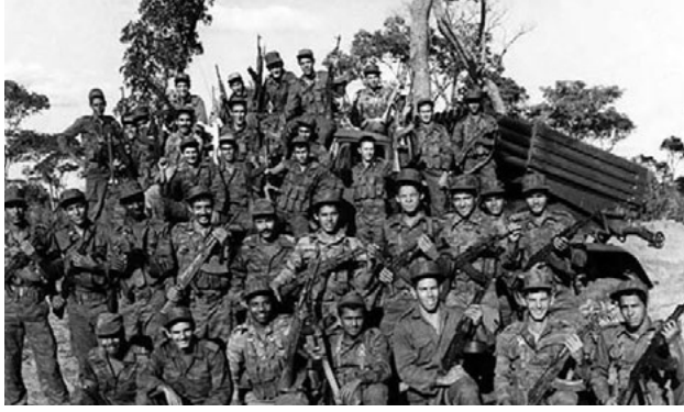
Cuban soldiers in Angola.

Cuba's brand of "medical internationalism" began in the 1960s with Cuba sending doctors to Algeria during its war with France. 57 Between 1966 and 1974, Cuba expanded its nascent medical missions program and sent doctors to work in Guinea-Bissau in support of its liberation struggle against Portugal. When Guinean President Amílcar Cabral requested Cuban assistance, the island sent a small military contingent to the region, along with a 31-member medical brigade. 58 In 1975, Cuba embarked on its largest military campaign in Africa, sending combat troops to Angola in support of the communist-aligned People's Movement for the Liberation of Angola and providing doctors alongside its military aid. 59