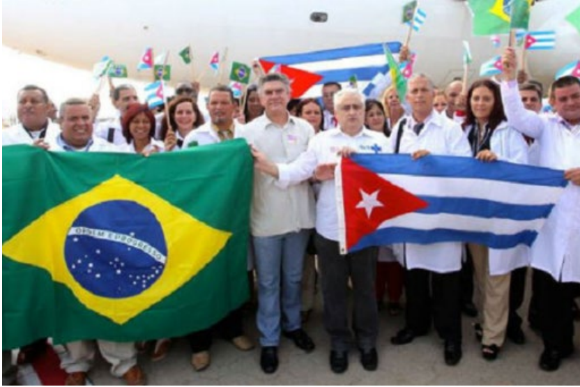
Cuban doctors hold Brazilian and Cuban flags as they arrive in Brazil to be part of the 'Mais Medicos' program in the country.

In 2013, Cuba created the Mais Medicos program with Brazil. While Cuba had medical programs in 60 other countries, its agreement with Brazil was one of the largest and most profitable, serving as a link between the cash-strapped island and South America's largest economy. 64 When Jair Bolsonaro was elected as president of Brazil in 2018, he ended the Mais Medicos program. President Bolsonaro announced the program could only continue if Cuban doctors directly received their salaries