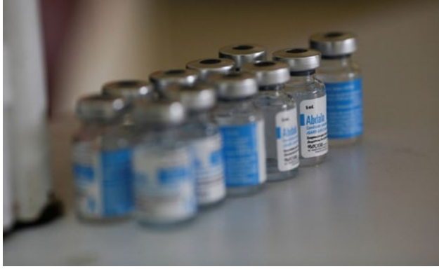
Doses of Cuba's Abdala coronavirus disease (COVID-19) vaccine are seen at a vaccination center in Caracas, Venezuela July 1, 2021.

Vietnam. 76 Cuba has said that they could produce 120 to 200 million doses a year, which could generate gross income of $600 million to $1 billion for the island's regime. 77