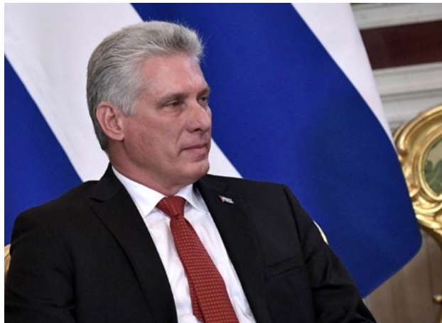
Miguel Diaz-Canel in negotiations with President Putin, November 2, 2018.

The information presented in this brief demonstrates that the Cuban government has engaged with impunity in state-sponsored human trafficking that violates Cuba's international law obligations. Cuba's totalitarian regime has used its disproportionate power over medical professionals and their conditions of employment to exploit and abuse healthcare workers through myriad coercive mechanisms, ranging from threat of family separation and forced exile to movement restrictions and wage theft. Cuban doctors fear their refusal to participate in the medical missions will generate reprisals from the government,