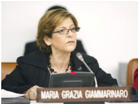
Maria Grazia Giammarinaro, Special Rapporteur on trafficking in persons, especially in women and children.

In the case of Cuba, intergovernmental organizations and foreign governments have denounced state-sponsored human trafficking in Cuba's medical missions. For instance, in the 2018 UN Universal Periodic Review of Cuba, the U.K. recommended the island to "[c]riminalize all forms of human trafficking [...] and address coercive elements of Cuban labour practices and foreign medical missions." 42 In September 2019, the U.S. Department of State announced visa restrictions on Cuban officials engaged in "exploitative and coercive labor practices" in the medical missions program. 43 Also, in November 2019, Ms. Urmila Bhoola (UN Special Rapporteur on contemporary forms of slavery, including its causes and consequences) and Ms. Maria Grazia Giammarinaro (UN Special Rapporteur on trafficking in persons, especially in women and children) sent a letter to the Cuban government, stating that the working conditions reported to them "from first-hand sources" could amount to forced labor. 44 Moreover, the 2021 TIP Report found that there is a "government policy or government pattern" in Cuba to profit from labor export programs with strong indications of forced labor, particularly in Cuba's medical missions. 45