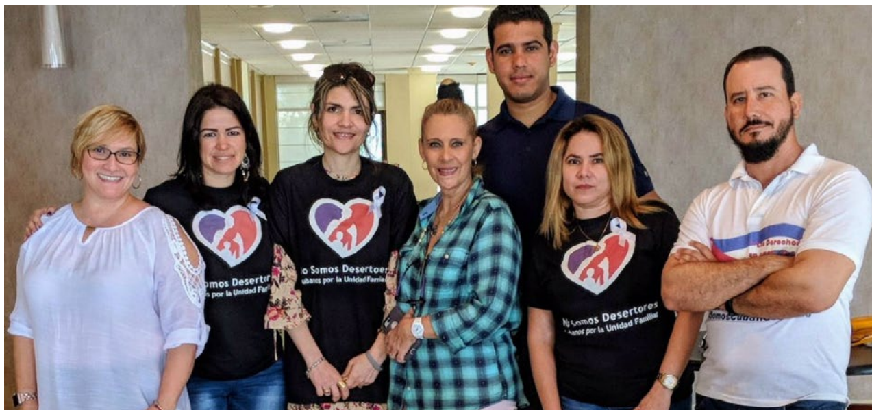
Cuban doctors gathered in Miami.

Medical workers subject to Migration Law 1312 who have tried to enter Cuba have received inadmissibility documents at customs and have been immediately deported. 118 Members of the group No Somos Desertores 119 have reported that the Cuban government has prevented them from entering the island for emergencies and funerals of relatives because they have “abandoned” medical missions or overstayed their assignments. 120