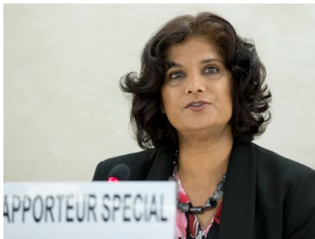
Urmila Bhoola, Special Rapporteur on contemporary forms of slavery, including its causes and consequences, during the 30th regular session at the Human Rights Council, 14 September 2015.