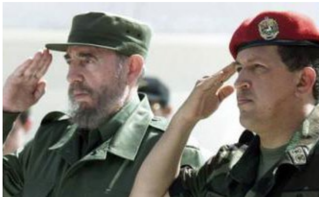
Fidel Castro and Hugo Chavez

The Cuban government's efforts to expand its medical missions program continued throughout the mid-2000s through structural changes in the island's healthcare system. In 2010, the Ministry of Health announced a personnel reduction in the domestic healthcare sector so that more doctors could be sent abroad "to earn hard currency." 62 In 2011, the Cuban government also carried out a series of privatization measures following the Russian model to make the state-owned economy fit into a free-market world. As a result, Cuba created the Comercializadora de Servicios Médicos Cubanos, S.A., the corporation that took over the business of exporting health personnel. Through this entity and thanks to the alliance with Venezuela, it was possible to export Cuban health-care labor on a massive scale. 63