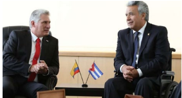
Moreno and Diaz Canel meeting at the UN HQ in New York.