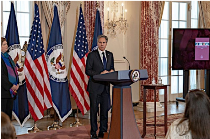
Secretary Antony J. Blinken at the 2021 Trafficking in Persons (TIP) Report Launch Ceremony.

The incorporation of a human rights-based approach in the Palermo Protocol and other “soft law” instruments acknowledges that all forms of human trafficking are indeed human rights violations. It changes the way states should approach anti-trafficking efforts, integrating human rights into their analysis of the problem and their responses. Identifying human trafficking as a human rights violation also triggers state obligations under binding human rights treaties. Crucially, a human rights-based approach can potentially expand the focus of human trafficking from criminal justice and crime