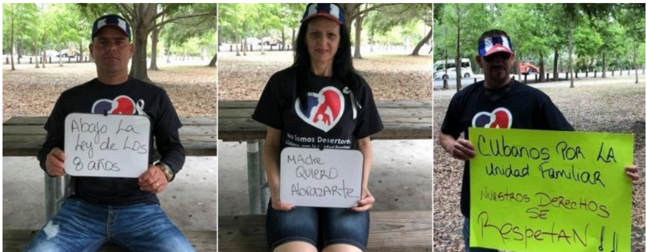
No Somos Desertores supporters holding up signs of the 8 year ban. "Médicos cubanos exigen que se les permita viajar a la Isla"

It is important to note that it is an accepted principle of international law that treaties apply to all individuals within a state's jurisdiction, including non-citizens. 111 As such, we can argue that host countries also have human rights obligations to all individuals living in their territory, including Cuban medical workers. The International Covenant on Civil and Political Rights (ICCPR), 112 which most host countries have ratified, protects the rights to freedom of expression and association, liberty, and movement. The International Covenant on Economic and Social Rights (ICESCR), 113 which recognizes the right to just and favorable conditions of work and to an adequate standard of living, enjoys almost universal ratification. Equally important, the Universal Declaration of Human Rights 114 contains freedom of speech and movement protections, including the right of all individuals "to leave any country" and to return to their birth country. As a result, host countries have an international law obligation to prohibit Resolution No. 168 from taking place in their territories, ensuring effective anti-trafficking and human rights protections for Cuban doctors.