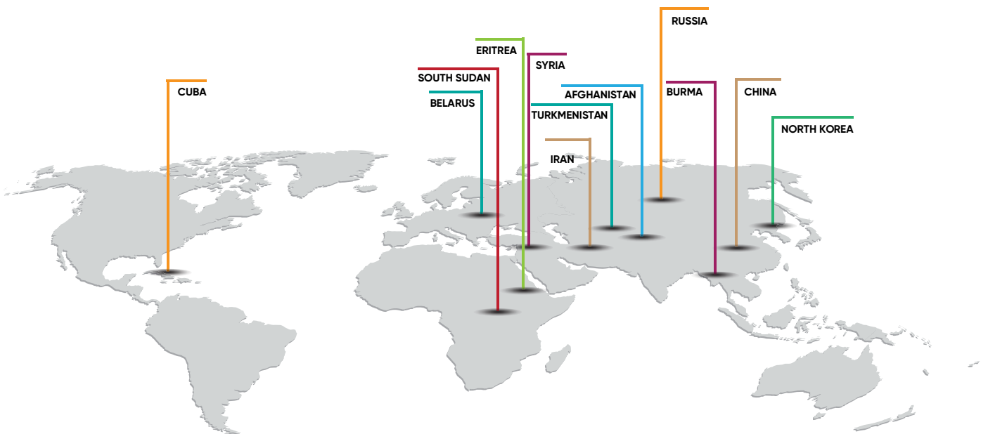
Governments with a “policy or pattern” of human trafficking according to the 2020 TIP

In 2019, the U.S. Congress amended the TVPA to note that governments can show a “policy or pattern” of human trafficking. This amendment recognizes state-sponsored human trafficking in government-funded programs, specifically forced labor in government-affiliated medical services such as Cuba’s medical missions. 38 Although the TVPA already considers whether government officials “participated in, facilitated, condoned, or were otherwise complicit in trafficking” when deciding tier rankings, the 2019 amendment directly connects government-sponsored human trafficking to a Tier 3 ranking. 39 In fact, the 2020 TIP Report marked the first time the U.S. Department of State applied this new legal provision, finding that the following governments had a “policy or pattern” of human trafficking: Afghanistan, Belarus, Burma, China, Cuba, Eritrea, Iran, North Korea, Russia, South Sudan, Syria, and Turkmenistan. 40 The 2021 TIP Report equally determined that all previous states (except Belarus) have an ongoing documented “policy or pattern” of human trafficking, trafficking in government-funded programs, forced labor in government-affiliated medical services, sexual slavery, or the recruitment of child soldiers. 41