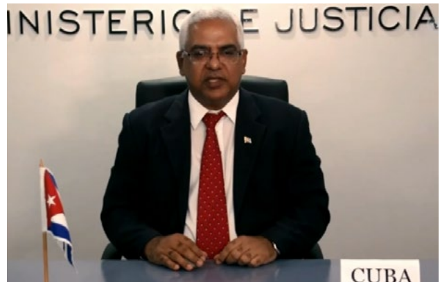
Minister of Justice Oscar Silvera Martínez's pre-recorded statement at the General Assembly.

Cuban doctors also face state-imposed burdens to secure independent labor contracts abroad. Cuba requires doctors to have special permission to leave the country. 81 The Ministry of Health often refuses to issue proof of the educational credentials of health professionals. In November 2018, the Cuban government issued additional restrictions regarding issuance of educational credentials, prohibiting the legalization of academic or other types of documents for health professionals serving in missions or attending international events. 82 This tactic renders Cuban doctors unable to demonstrate their qualifications to practice outside Cuba. As a result, their only option to work overseas is through the government’s medical missions.