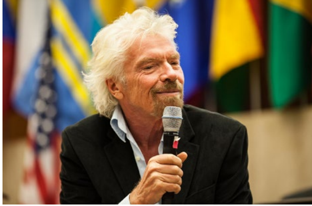
Richard Branson.