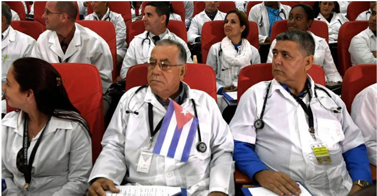
Cuban doctors attending a conference in Kenya.

In the following brief, we (1) present the legal instruments (international treaties and "soft law" norms) that call on states to protect the rights of human trafficking victims and incorporate a human rights approach to human trafficking solutions; (2) provide background information regarding the development of Cuba's medical missions; (3) outline the main coercive mechanisms Cuba uses to exploit the labor of its healthcare workers; (4) describe the role of the medical missions as "money-making" operations benefiting the Cuban regime; and (5) present a conclusion on the prior findings and suggest policy changes.