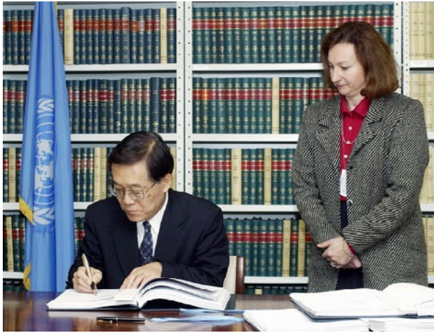
Signing ceremony of the Palermo Protocol, 9 December 2002.

human rights.” 6 Article 6 contains specific obligations to protect the privacy and identity of trafficking victims, as well as to aid in their “physical, psychological and social recovery” considering their “age, gender and special needs.” 7 Moreover, according to Article 14, the Protocol will not affect the obligations of states under international law, including international humanitarian law and international human rights law. 8